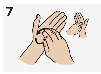
Rotational rubbing, backwards and forwards with clasped fingers of right hand in left palm and vice versa