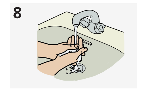
Rinse hands with water