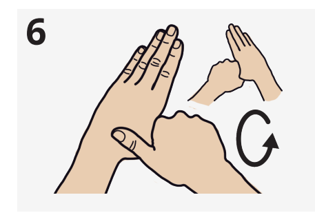
Rotational rubbing of left thumb clasped in right palm and vice versa