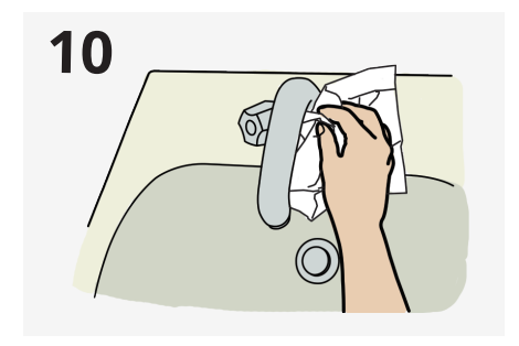
Use towel to turn off faucet