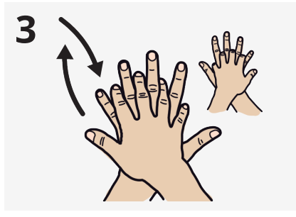
Right palm over left dorsum with interlaced fingers and vice versa