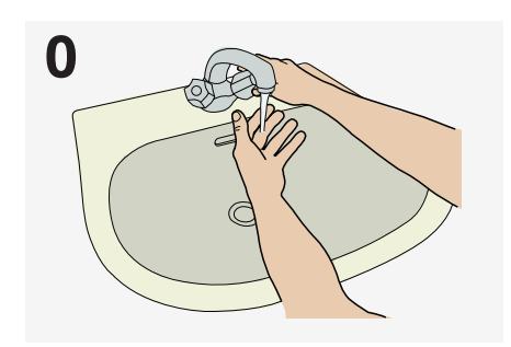
Wet hands with water